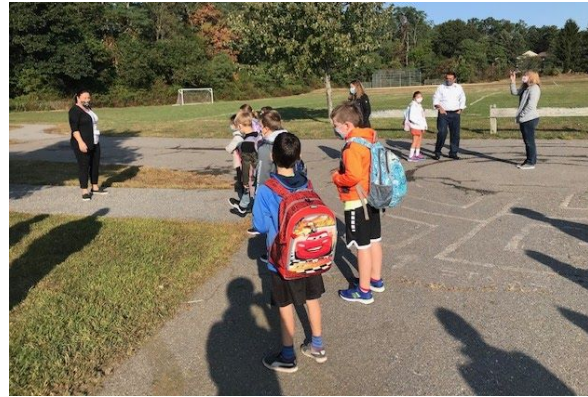
Students prepare to line up.