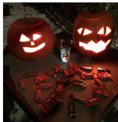
A treat or tricking table for our times.