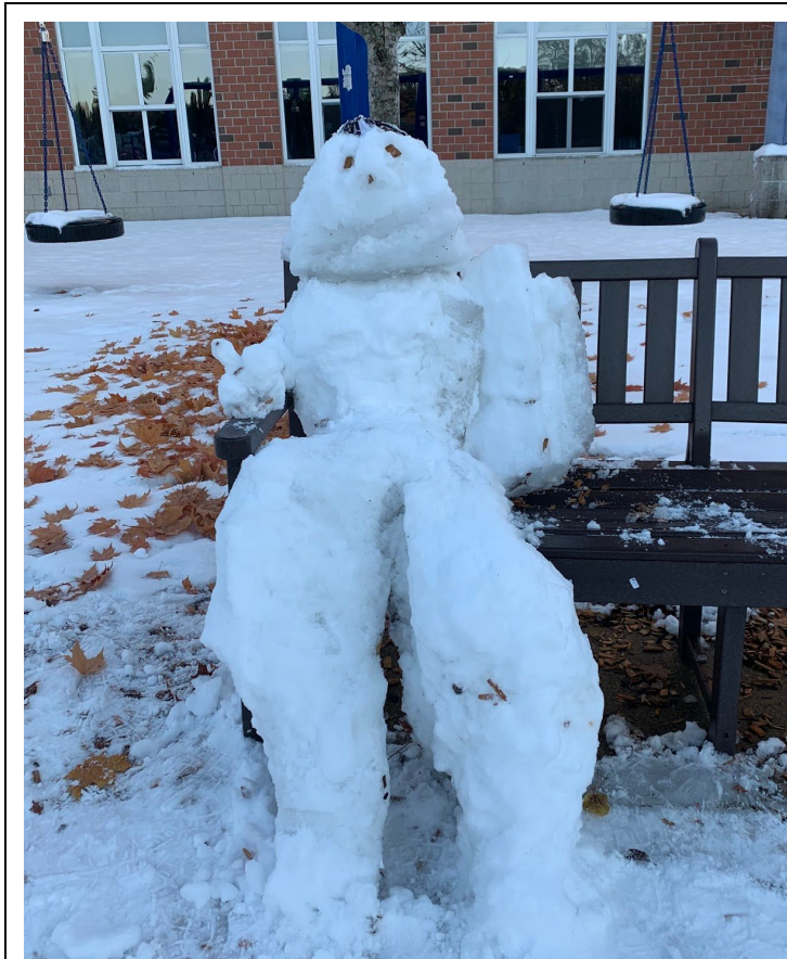
This snowman visited campus early--on October 30!