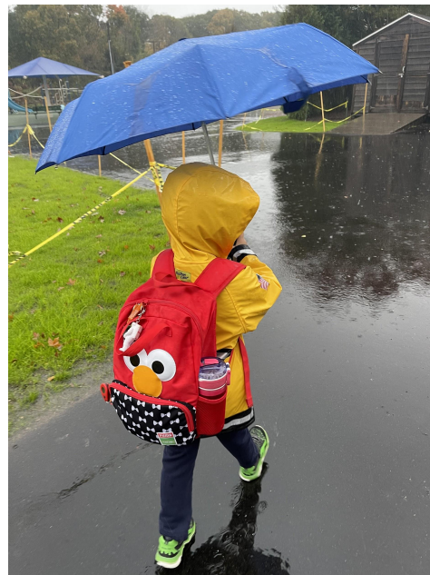
Kai O (K-Henry) faces the rain.